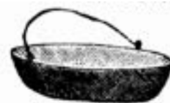
SARATOGA POTATO FRYER.

Cook Book , p 108) and an ointment for chapped hands ( Contributed Recipes , p 52). But maybe wait on tackling “Clam Chowder for 100 People” ( Boethian cook book , p 6) until our current crisis has passed. •