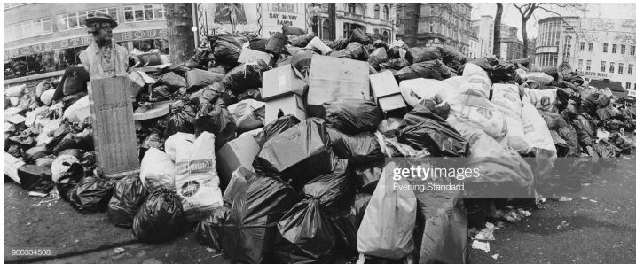
Trash in Leicester Square in London: Hulton Archive, 1979