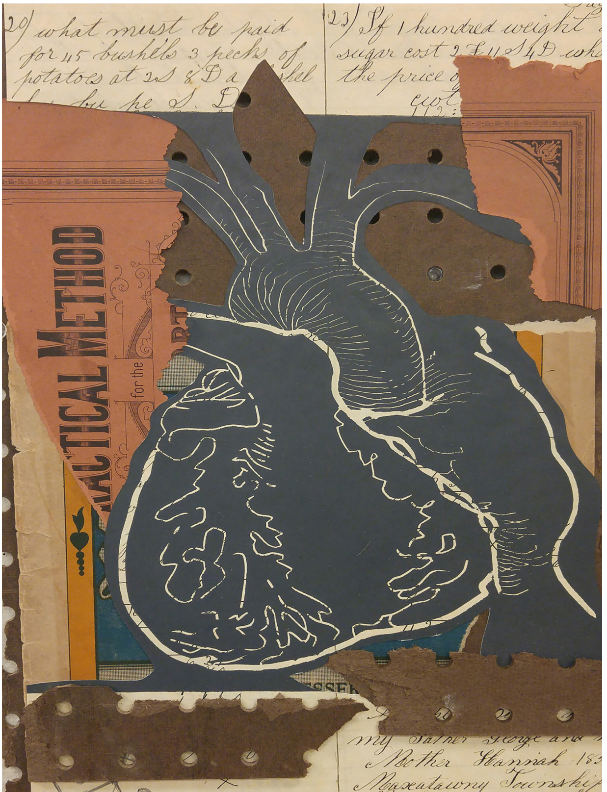
Internal Method (linoleum relief cut and collage), Ashley Lester