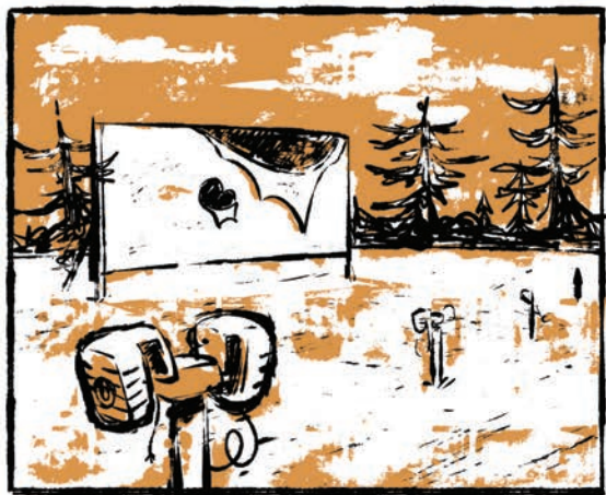
THE DRIVE IN