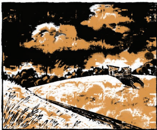
THE CAVED IN BARN