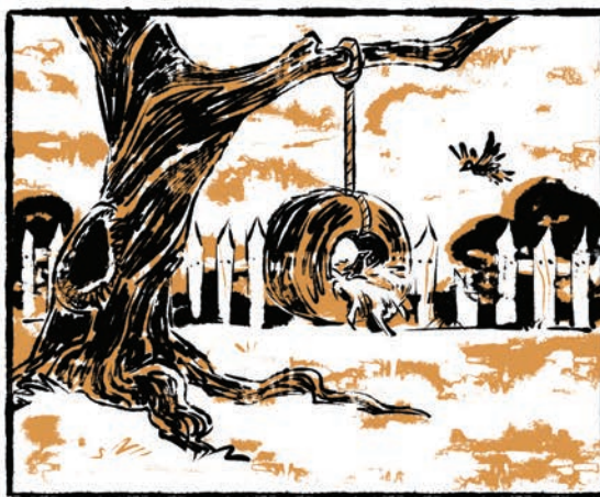
THE OLD TIRE SWING