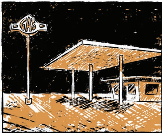
THE GAS STATION