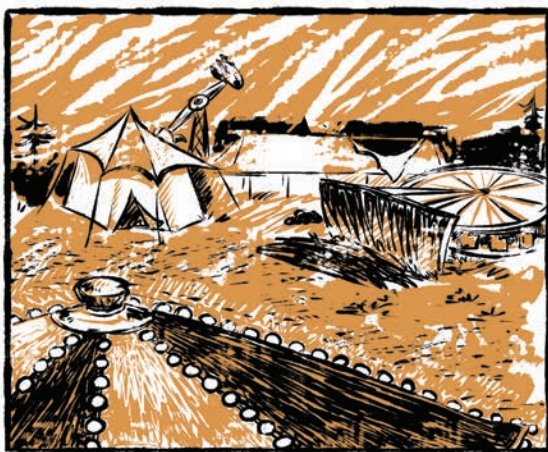
THE FORGOTTEN FAIR