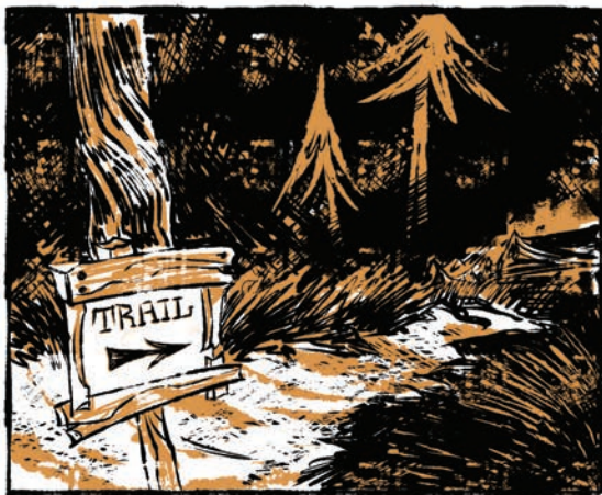
THE ONCE BEATEN TRAIL