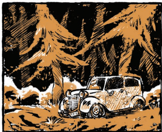
THE JALOPY IN THE WOODS