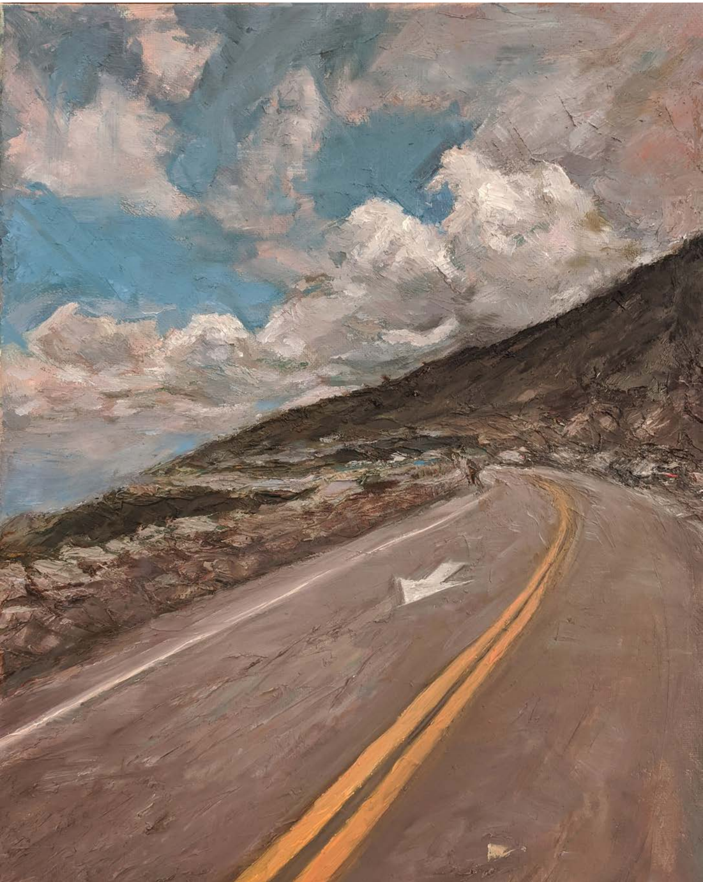
White Face (oil on board), Hunter Celeste