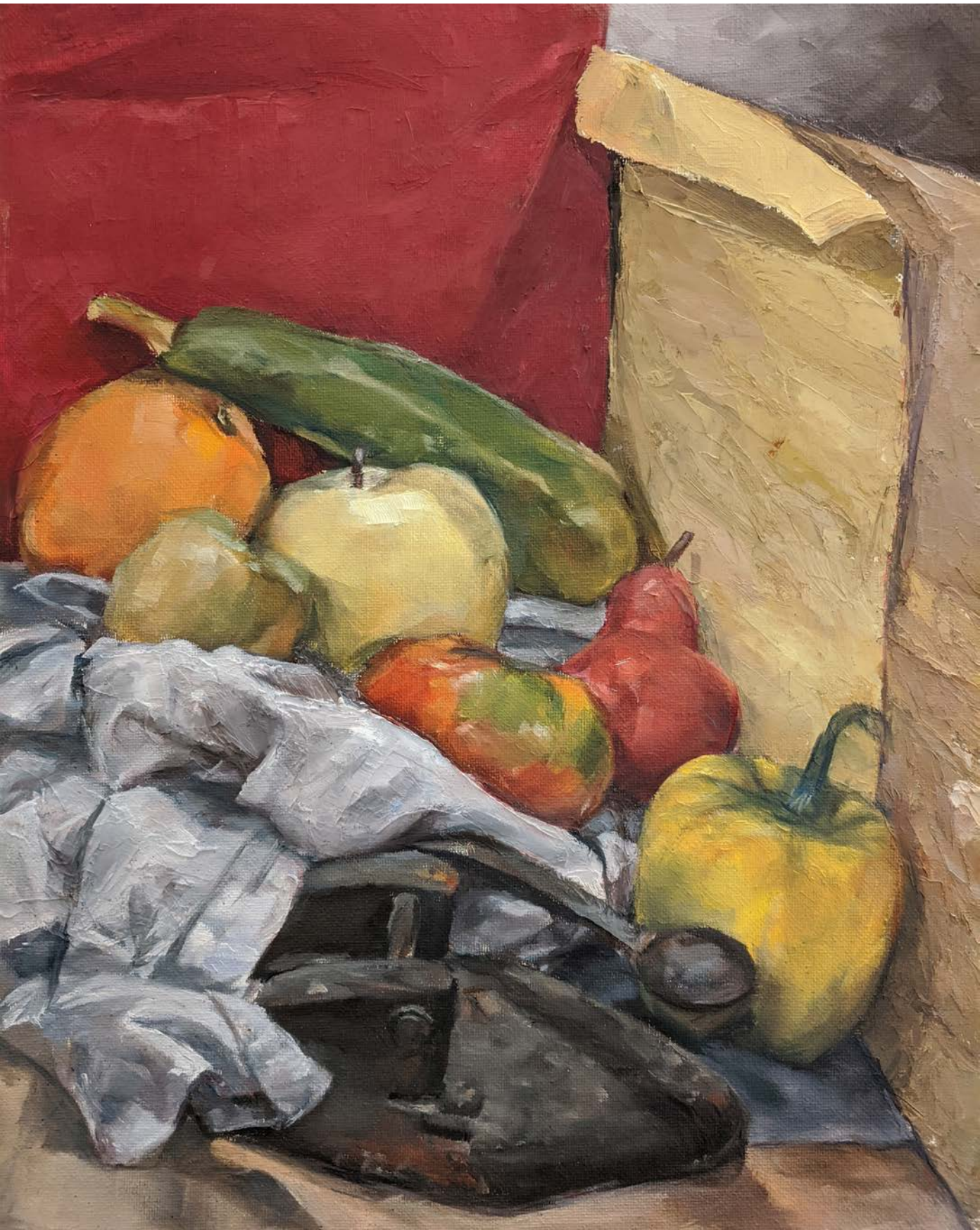
Still Life (oil on canvas), Hunter Celeste