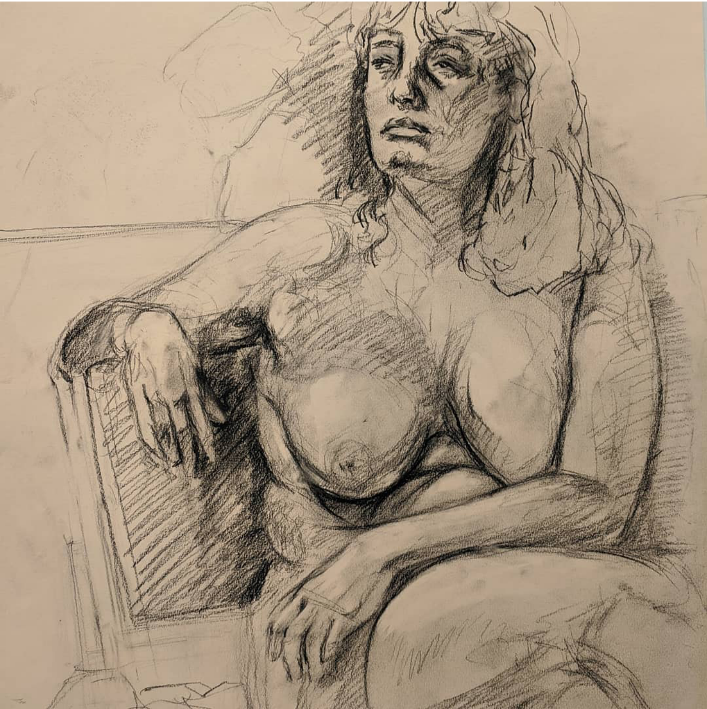
Figure Study (charcoal on canson), Hunter Celeste